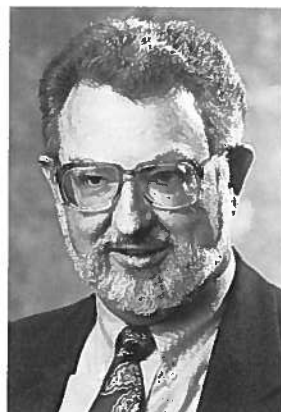
William Browder c

Continuing Education Organizational Behavior Organizational Development Public Health Practice