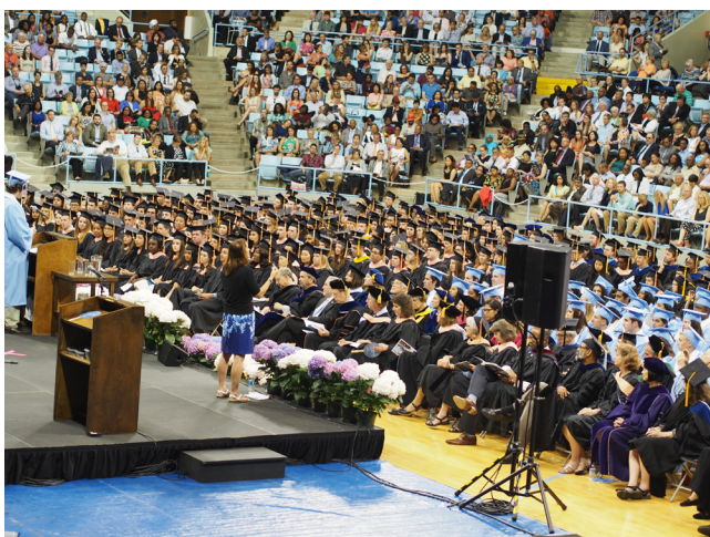
Graduates and members of the faculty assembled for the Gillings School's 2016 commencement ceremony on May 7.

Be sure to check out the video and audio recordings of interviews with some of our illustrious former chairs and faculty members at epidemiologyweb.unc.edu/epidemiology-interviews