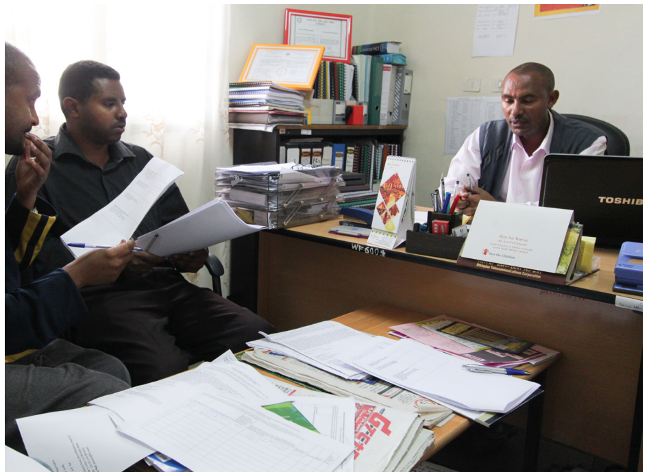
MEASURE Evaluation personnel review data from project activities.