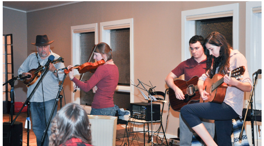
Here are scenes from the Winter Music Fest, a tradition of the Department of Epidemiology. Do you see anyone you know?