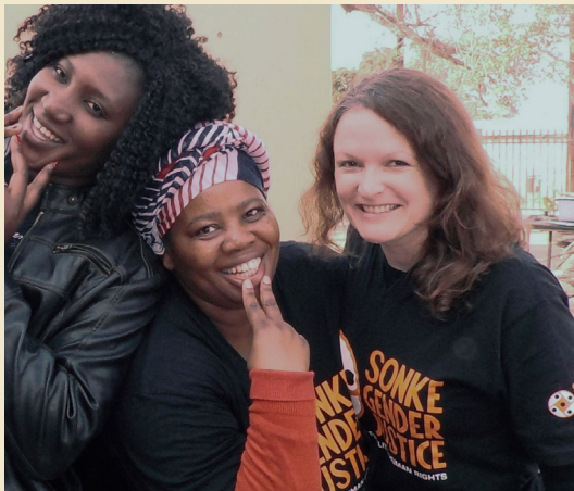
DeLong (right) poses with collaborators from Sonke Gender Justice, South Africa.

Tiyani Vavasati’s study design is built upon CCT. The present study enrolled intervention women from