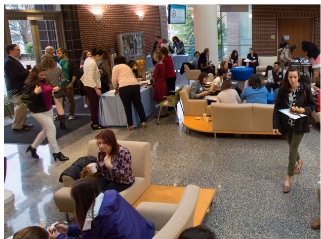
Students admitted to the Gillings School for the 2016-2017 academic year enjoyed "Experience Gillings!" in April.