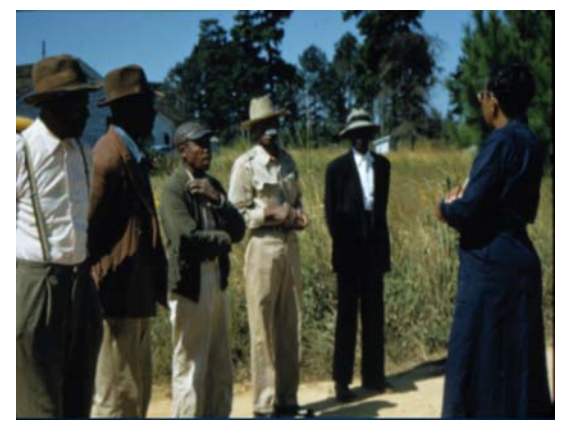
Tuskegee Syphilis Study