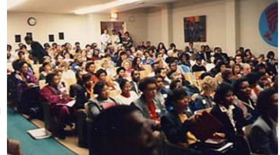
The early Minority Health Conferences were held in Rosenau Auditorium (shown at right)